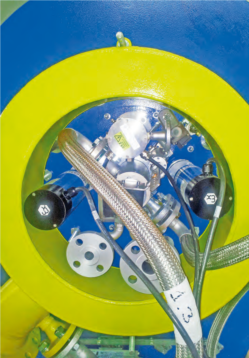
MIXED NATURAL GAS-FUEL OIL BURNER MODEL JBD-50,000-GFO WITH VAPOUR ATOMIZATION FOR ZONE 1 WITH EQUIPMENT WITH EEXD CLASSIFICATION FOR THE REPSOL – TARRAGONA REFINERY.

An explosion produces a rapid combustion, heat, noise and pressure wave due to the expansion of the gases that are produced.