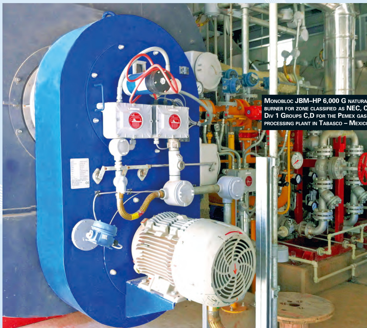
MONOBLOC JBM-HP 6,000 G NATURAL GAS BURNER FOR ZONE CLASSIFIED AS NEC, CLASS I DIV 1 GROUPS C,D FOR THE PEMEX GAS PROCESSING PLANT IN TABASCO – MEXICO.